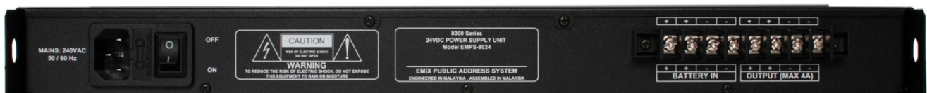
Diagram 3.0: Rear view of the 24VDC power supply unit

** NOTE: Most of the battery would drained significantly over night